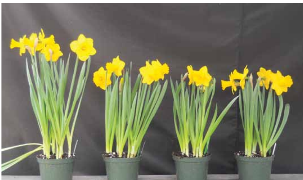
Figure 4. The effects of a Florel drench on 'Primeur' daffodils at full flower. Seventeen cold weeks in the greenhouse on Jan. 31. Left to right: Control (no Florel) or 250 ppm applied (4 ounces per 6-inch pot) one, six or nine days after transferring plants into the greenhouse.