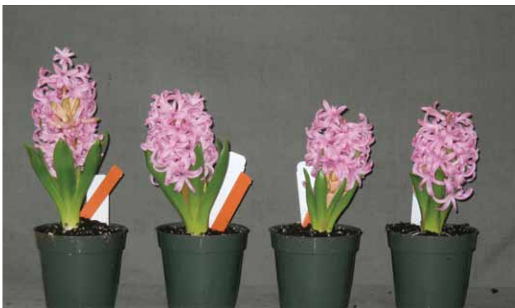
Figure 5. The effects of a Florel drench on 'Pink Pearl' hyacinths at full flower. Seventeen cold weeks in the greenhouse on March 8. Left to right: Control, 200-, 350-, or 500-ppm Florel (2 ounces per 4-inch pot) applied three to four days before the first flower opened.

of application was the same as for a normal Florel spray: when daffodil leaves were about 3 to 4 inches tall, and for hyacinths three to four days before the lowest flower opened. Results are summarized below.