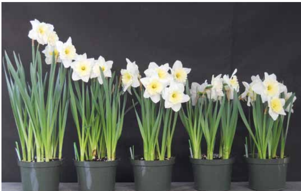
Figure 3. The effects of a Florel drench on 'Ice Follies' daffodils at full flower. Eighteen cold weeks, in the greenhouse on March 6. Left to right: Control, 100-, 200-, 300-, or 500-ppm Florel drench (4 ounces per 6-inch pot) applied at the 2- to 4-inch leaf stage.