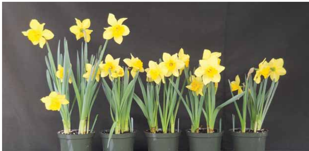
Figure 2. The effects of a Florel drench on 'Carlton' daffodils at full flower. Eighteen cold weeks in the greenhouse of March 6. Left to right: Control, 100-, 200-, 300-, or 500-ppm Florel drench (4 ounces per 6-inch pot) applied at the 2- to 4-inch leaf stage.

Ethylene is released from the substrate over many days, and the speed of release varies within the pH range of soil-less mixes (5.4 to 6.2). Florel substrate drenches can perhaps be thought of as a "slow release" ethylene treatment system. Substrates at a low pH have a longer but slower release